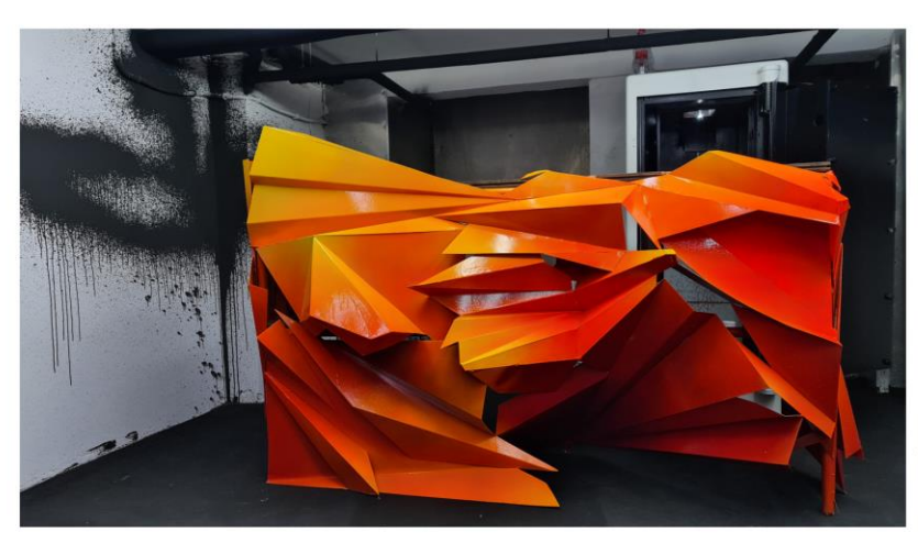
"the count" recontextualized readymade with spraypainted extensions berlin 2021